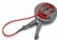
Inductive Signal Clamp