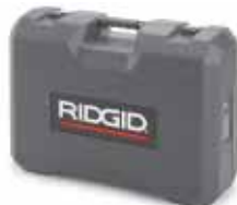
NaviTrack II Case