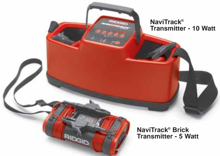
NaviTrack® Transmitter - 10 Watt