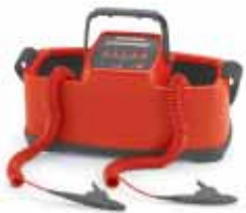
NaviTrack Transmitter 10 Watt